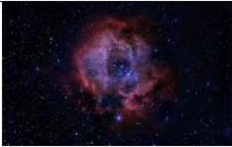
Rosette (see page 5)

Meeting News: The October meeting we discussed Los Flores ranch solar viewing and Lunar eclipse event during November.