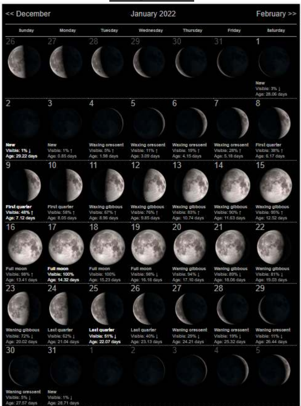
January 2022 Moon