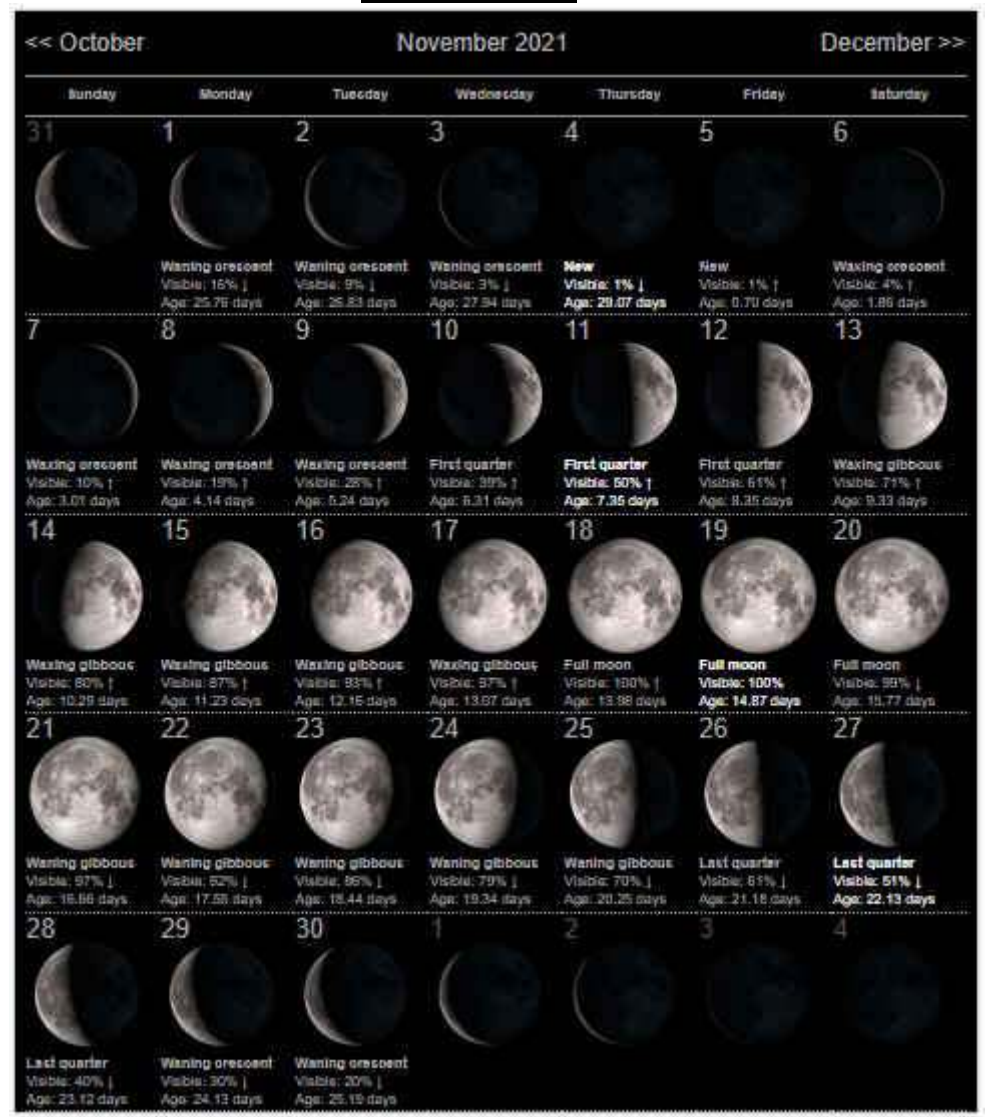
Full 19<sup>th</sup>, New 4th, Last Quarter 27<sup>th</sup>, First Quarter 11<sup>th</sup>.

Moon Facts and folk lore The Moon is the fifth largest natural satellite in the Solar System. At 3,475 km in diameter. Earth is about 80 times the volume than the Moon, but both are about the same age.