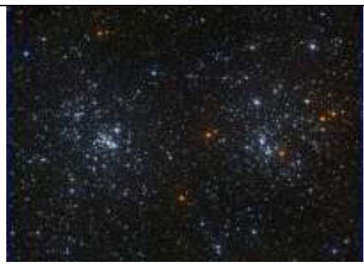
Double Cluster (see page 5)