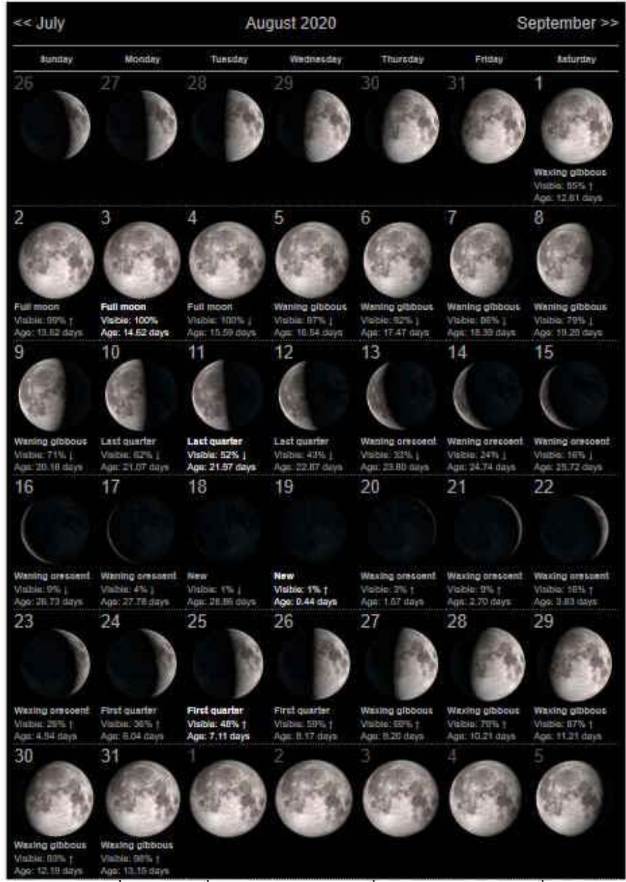
Full 3<sup>rd</sup> New 19<sup>th</sup>, Last Quarter 11<sup>th</sup>, First Quarter 25<sup>th</sup>