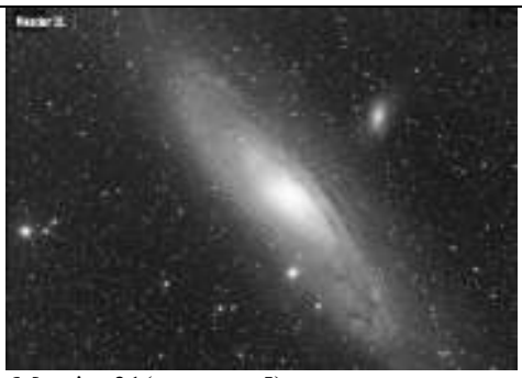
Messier 31(see page 5)