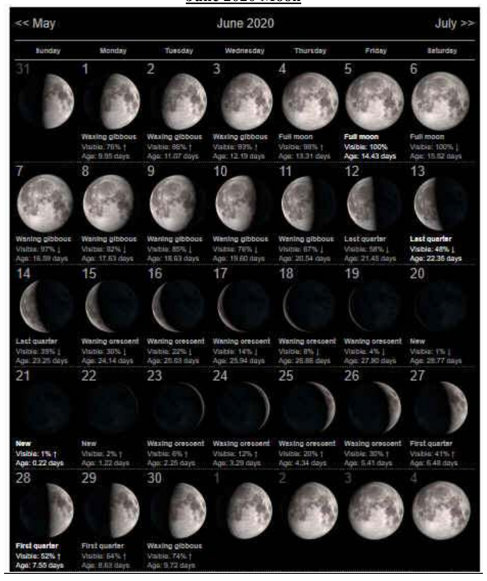
Full 5^{th} , New 21^{st} , Last Quarter 13^{th} , First Quarter 28^{th}