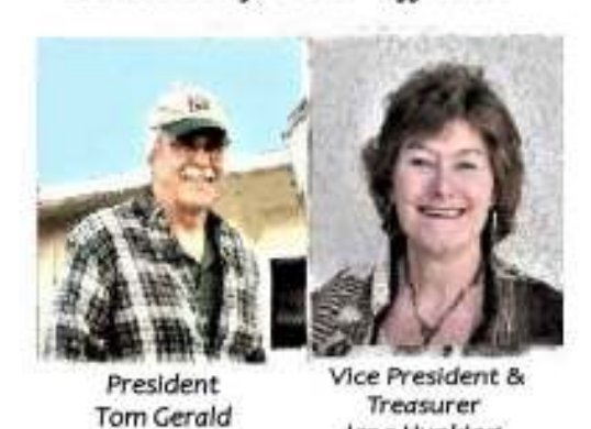
ACL Support Personnel