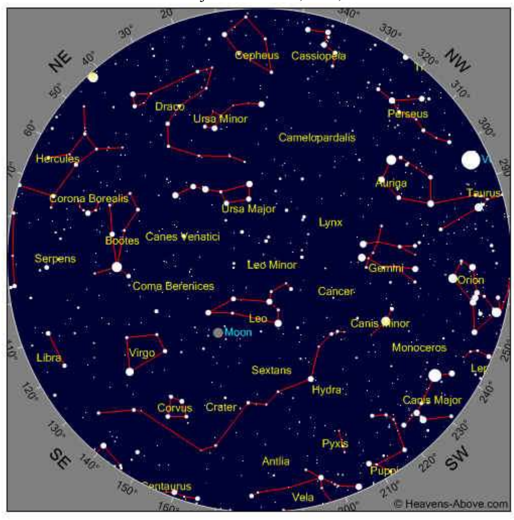
<u>April 2020 Sky</u> Some Objects of interest, M42, M13