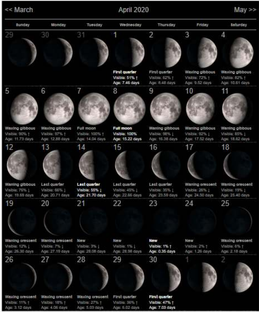
Full 8 th, New 23<sup>rd</sup>, Last Quarter 14<sup>th</sup>, First Quarter 1<sup>st</sup> & 30<sup>th</sup>