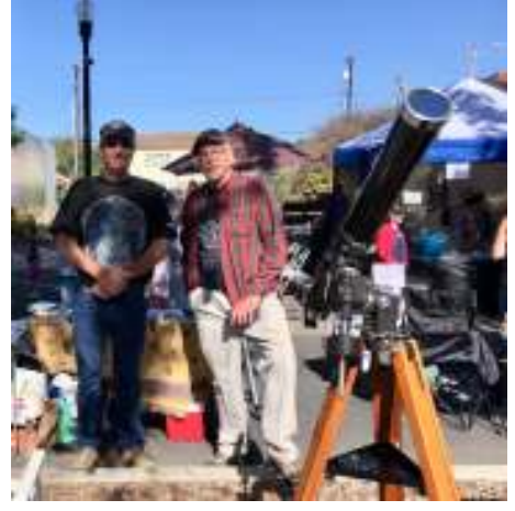
Old town Fair (July) ACL Display