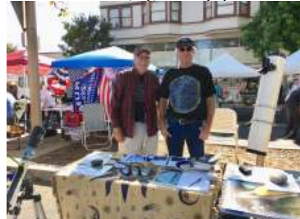
Old Town Fair (July) ACL display

August 31<sup>st</sup> Star Party at Observatory / Figueroa Mt.