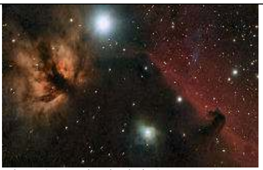
Flame & Horsehead nebula (see page 5)