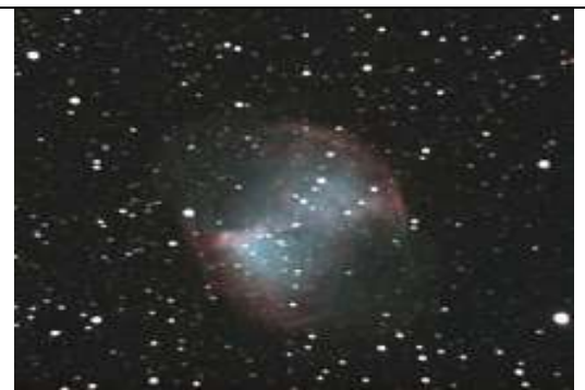
Messier 27 (see page 5)