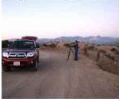
Craig Checking alignment