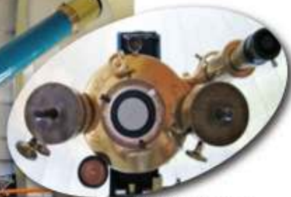
The Alvin Clark 8", f17 refractor named "Leah", showing the side view and "Business end". Note the large engravings on the brass endcap identifying it as an Alvin Clark telescope.